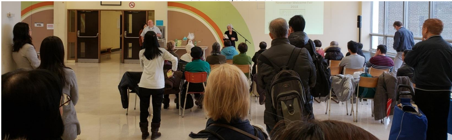
Kensington-Chinatown LIP Newcomer Welcome Fair 2018 (Maxwell)