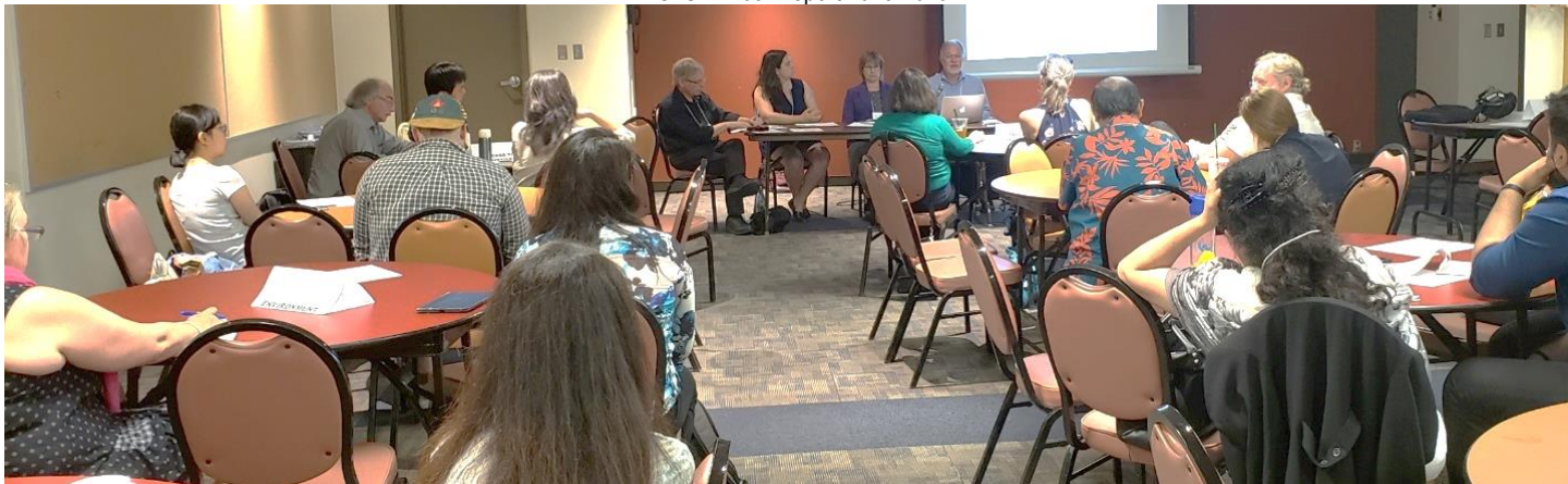
Conference of Community Partners on Provincial Budget, June 26, 2019, North York Civic Centre