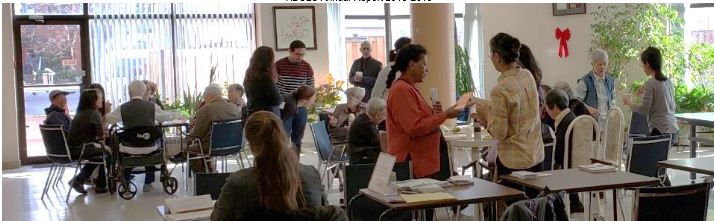
Seniors Info Fair and Social, November 28, 2018, Leonardo Court