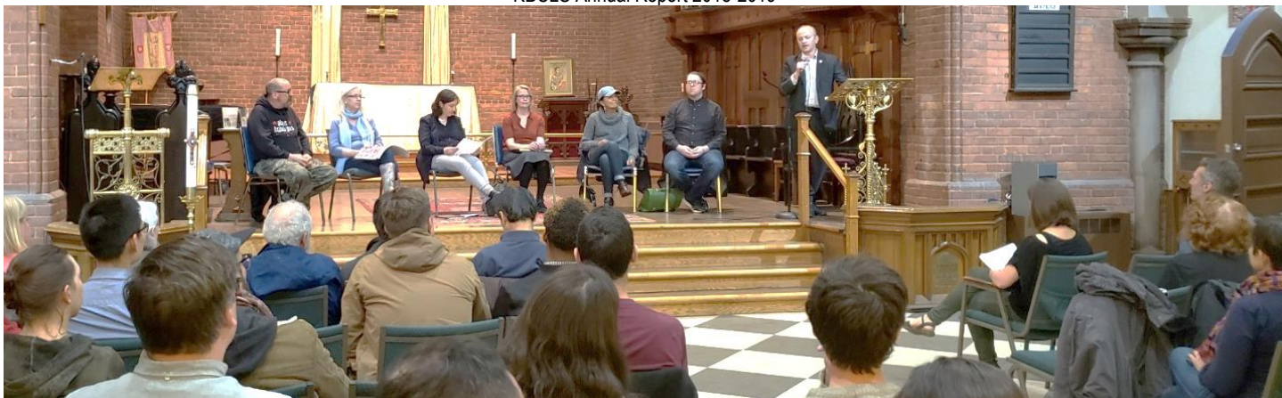
Kensington Avenue Tenants Meeting, May 9, 2019, St. Stephen in-the-Fields Anglican Church